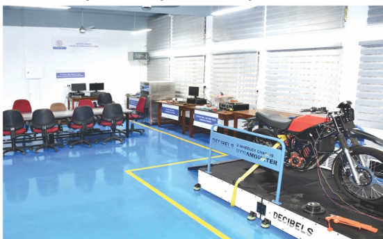
Centre of Competence in Electric Vehicles (EV-COC) with Decibels Lab