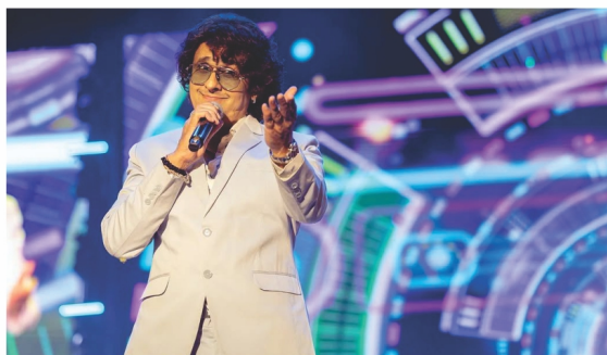
Live Concert by Sonu Nigam during AURA-25