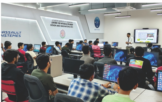
Centre for Interdisciplinary Design and Innovation powered by Dassault Systèmes