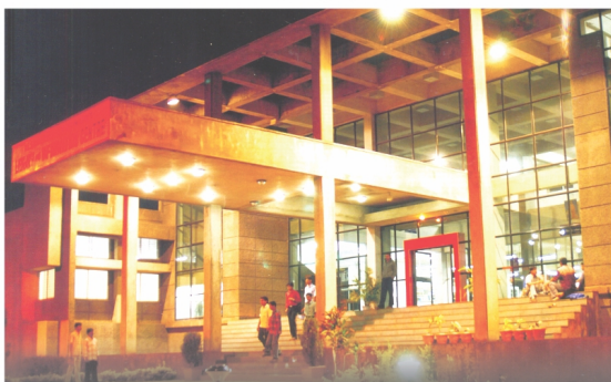
Library and Information Centre