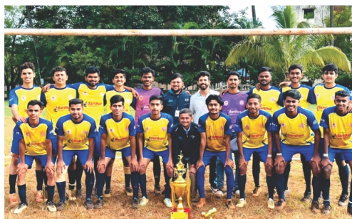
Football State Level Winners at New Horizon College of Engg., Bengaluru - 2024