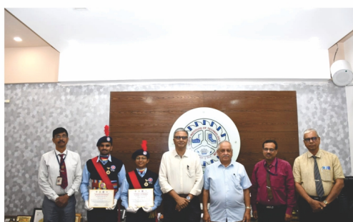
NSS volunteers from Aeronautical Department participated at State Republic Day Parade Jan 2025