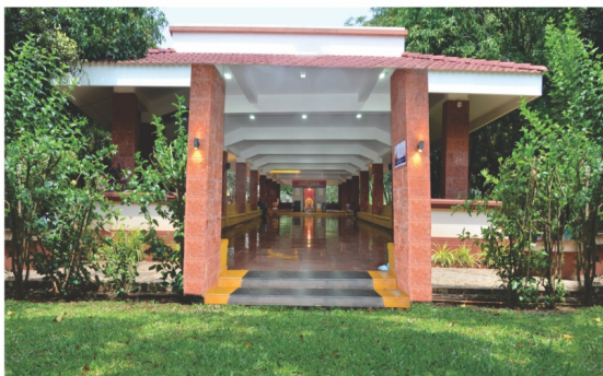
Shri Vidya Ganesha Temple