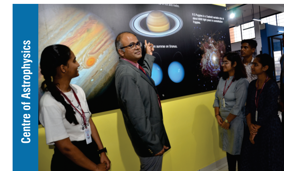
Centre of Astrophysics

Proud Asset of KLS GIT... 450+ Committed Staff