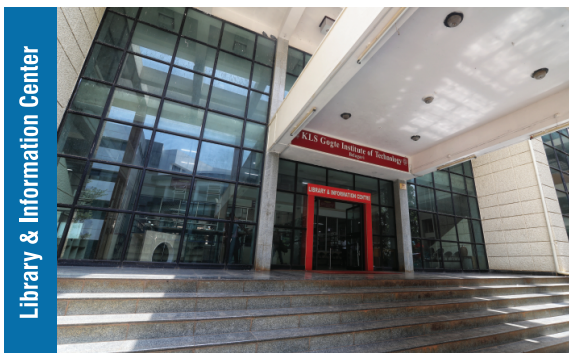
Library & Information Center